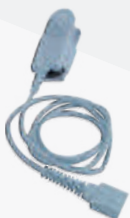
Adult Probe PA100