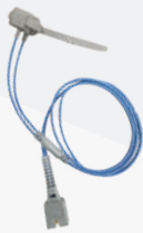
Neonatal Probe PB100