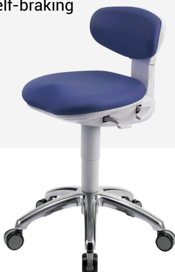
Navy Blue WXDUMANB