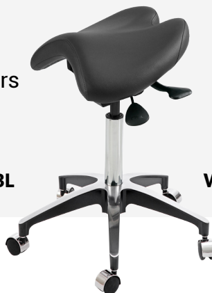
Navy Blue WX511201NB