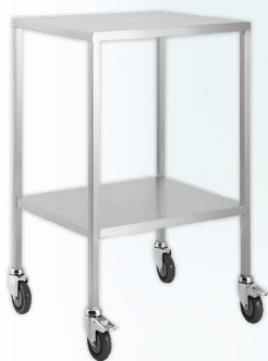
No Rails No Draws